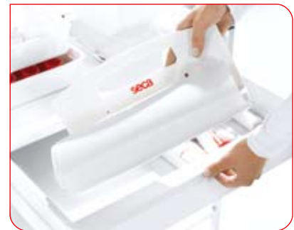
The measuring mat can be rolled up for space-saving storage.