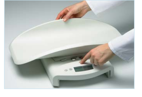
Baby scale and floor scale for children in one

Its compact, robust construction predestines the seca 354 as the scale for all those who have to be mobile in the interest of the health of their youngest patients. The power-saving battery operation – up to 20,000 weighings with just one set of batteries – makes the scale independent of electricity power supply. The practical optional carrying case seca 414 is ideal for transporting and safely storing the baby scale.