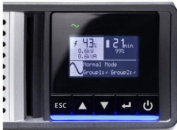
Intuitive LCD display for ease of configuration and management