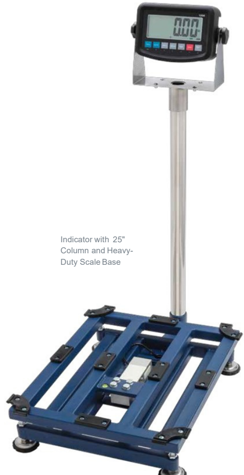
Indicator with 25" Column and Heavy- Duty Scale Base