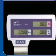
Client view pole display