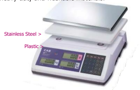
Stainless Steel >

Designed with both plastic and stainless steel trays that are made from heavy-duty and washable materials.