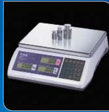
Dual interval technology

info@ansutek.co.nz www.ansutek.co.nz www.ansutekbiz.co.nz