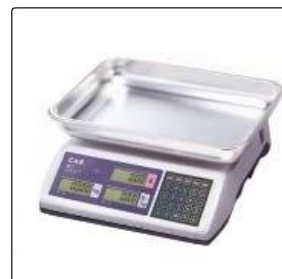
▲ Fish Tray