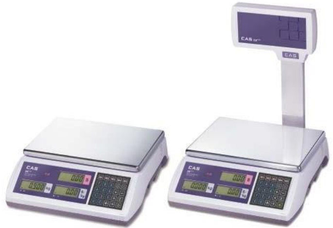
Standard Type ▲