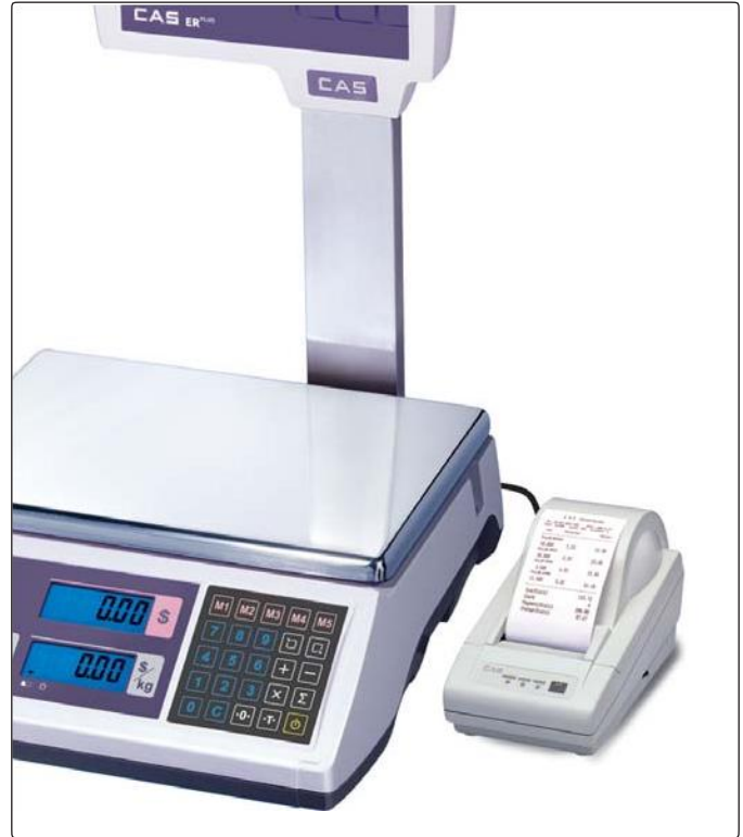
▲ Sample of a Ticket