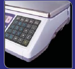
Soft touch key pad