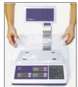
▲ Dust Protection Cover