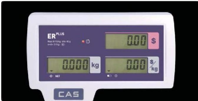
LCD Display ▲

The ER PLUS comes with an LCD display. Choose between the standard non-pole type or pole type display. The pole type display is reversed so that clients are in full view of price and weight.