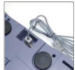
▲ RS-232C Interface