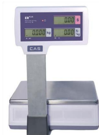
▲ Client view pole display