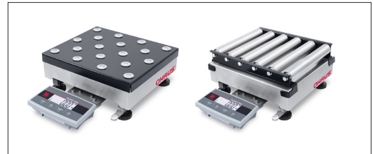
Ball Top and Roller Top Platform Options