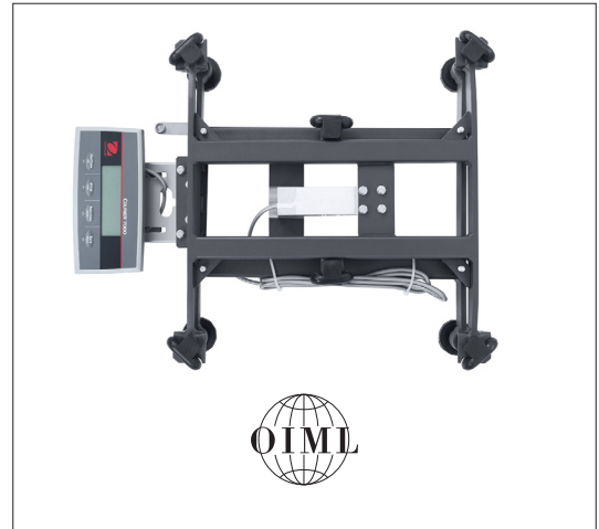
Sturdy powder-coated steel frame holds up to heavy daily shipping use