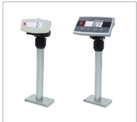
Optional Remote Display on column mount and Column Mount for scale indicator available