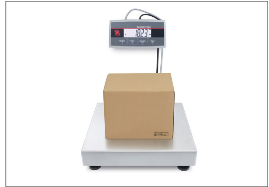
Integrates with shipping system software

Provides simple averaging of weights for unstable loads.