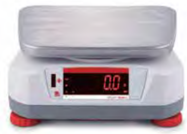
Rear Display with Integrated Touchless Sensor