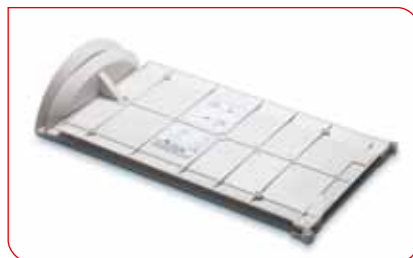
The high-quality folding mechanism guarantees a long service life.

The seca 417 stadiometer is ideal for mobile use. During regularly scheduled examinations, medical personnel check the nutritional condition and development of infants and toddlers. The process should go quickly, so it's important to be able to read results easily. The red markings and high-quality printing of the scale don't fade even after years of intense use.