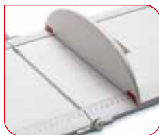
The measurement results are easy to read from the large scale.

A hinge joins together the two parts of the seca 417 measuring board. It has an integrated head piece and a separate foot positioner that smoothly runs along the gently raised guide rail. For a precise measurement, all the user has to do is place the head of the child against the head piece, stretch out the legs and move the foot positioner to the soles of the feet.